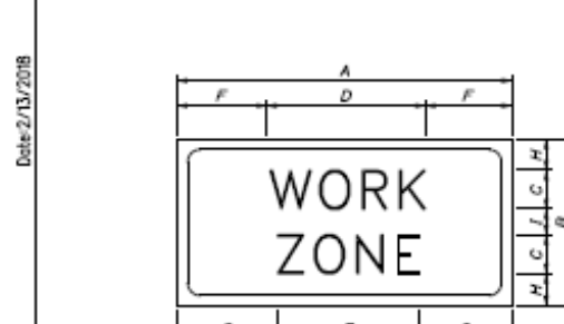
SIGN *1 1.25' BORDER, 0.75' INDENT, BLACK ON GRANGE, BB GRADE PLYWOOD SIGN